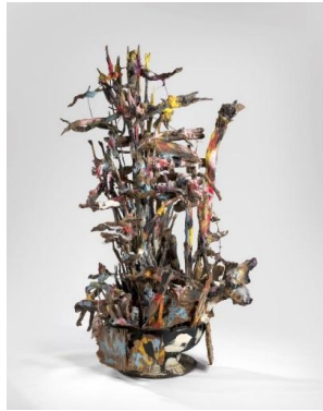
Tree of Life (In the Image of Old Things) , 1994 Thornton Dial, American, 1928-2016 Found wood, roots, rubber tire, wire, fabric, plastic air freshener, enamel, industrial sealing compound, 2018.62

Be inspired by works of art in the special exhibition, Cosmologies from the Tree of Life: Art from the African American South , on-view, June 8 – Nov 17, 2019.