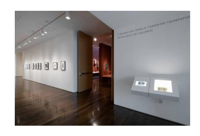
Installation view of Truthful Witnessing: The Black Photographers Annual, Volume 3 .

Free for VMFA members, children ages 6 and under, active-duty military personnel and their immediate families; $16 for adults, $12 for seniors 65 and older, and $10 for youth ages 7-17 and college students with ID