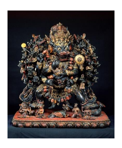
Vajrabhairava, 15<sup>th</sup> century or later, Sino-Tibetan, polychromed wood. Virginia Museum of Fine arts; Purchase with funds provided by the E. Rhodes and Leona B. Carpenter Foundation and the Arthur and Margaret Glasgow Fund.