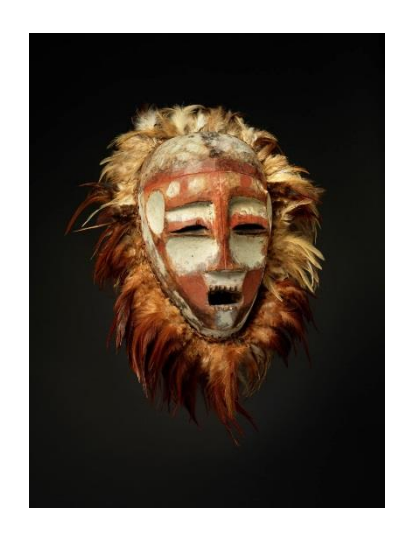
Face Mask with Feathered Collar, second quarter of the 20th century, Nyindu culture (Democratic Republic of the Congo), wood, pigment, rooster feathers, 15.3 in. high. Private Collection.