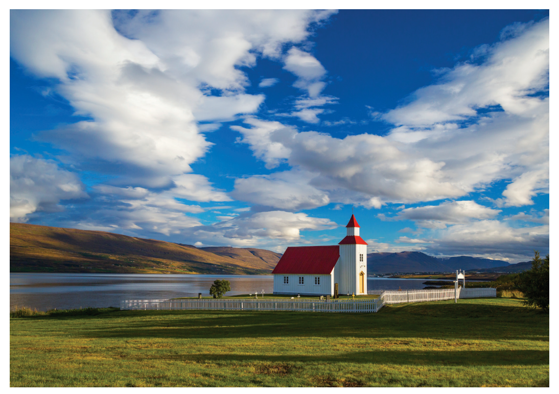
Iceland's landscape reveals an austere beauty.

fields, and lunar-like volcanic craters comprise a stunning national park. Our explorations begin with a stop at Godafoss, the "waterfall of the gods" named for the carvings of Norse gods discarded here when the country was declared Christian a thousand years ago. We continue with a walk to view the fascinating Hverfjall crater, a local landmark. Later we see the region's unique "pseudo craters," the boiling mud pots at Namaskard, the bizarre lava formations at Dimmuborgir, the explosive crater at Viti, and the flat volcano system at Krafla. Our last stop is at the incredible Glacial River Canyon National Park (Jokulsargljufur), yet another of Iceland's natural wonders, where we walk to jaw-dropping Dettifoss, Europe's most powerful waterfall and Iceland's "Niagara." After this day of stunning scenery, we arrive at our hotel in time for dinner together tonight. B,L,D