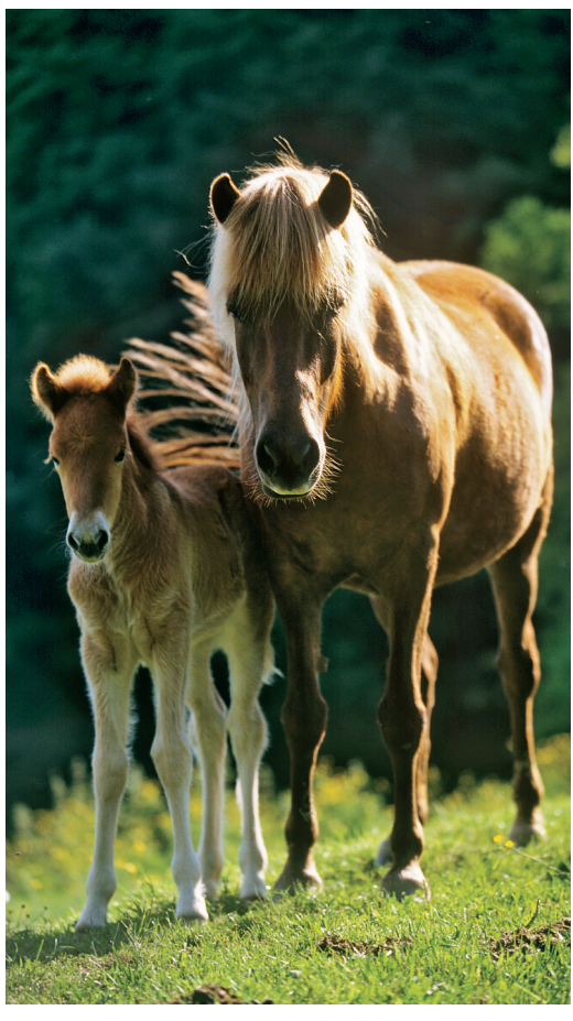
On Day 4 we visit a farm featuring famed Icelandic horses.

snowcapped mountains. We learn about the historic parliament founded here in 930 CE, and walk along a gorge into the rift valley itself. After a lunch at a local restaurant, we depart for famed Great Geysir and Gullfoss, Iceland's immensely popular "golden"