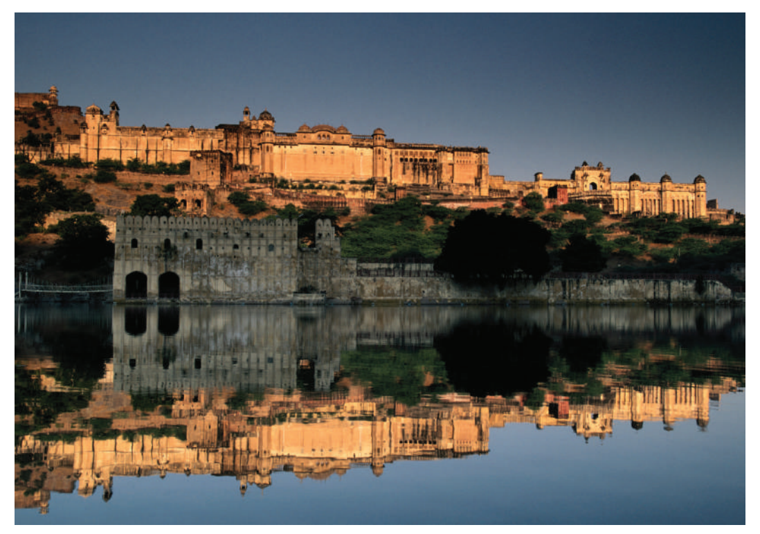
Visit Amber Fort, a UNESCO World Heritage site, on Day 6.

Day 8: Jaipur/Ranthambore We travel today to Ranthambore National Park, the former hunting ground of the Maharajah of Jaipur and now a 512-square-mile natural preserve that is home to hundreds of species of birds, reptiles, mammals, and of course, Bengal tigers. This afternoon we take our first wildlife drive through the park. B , L , D