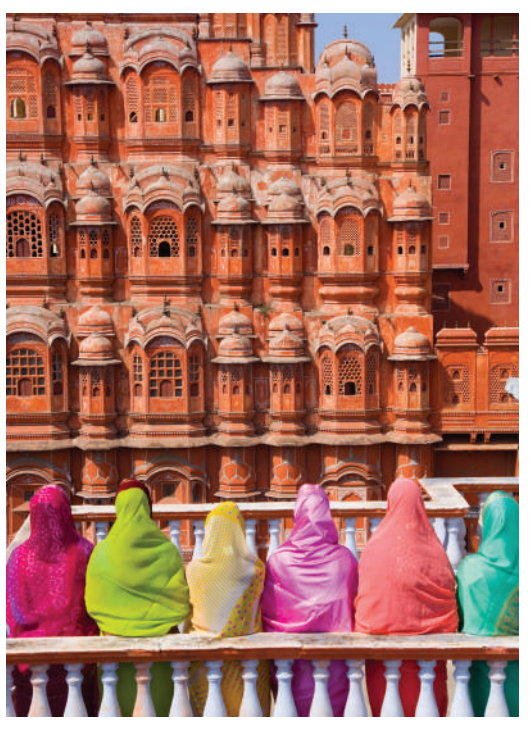
We visit elaborate Hawa Mahal, "Palace of the Winds."