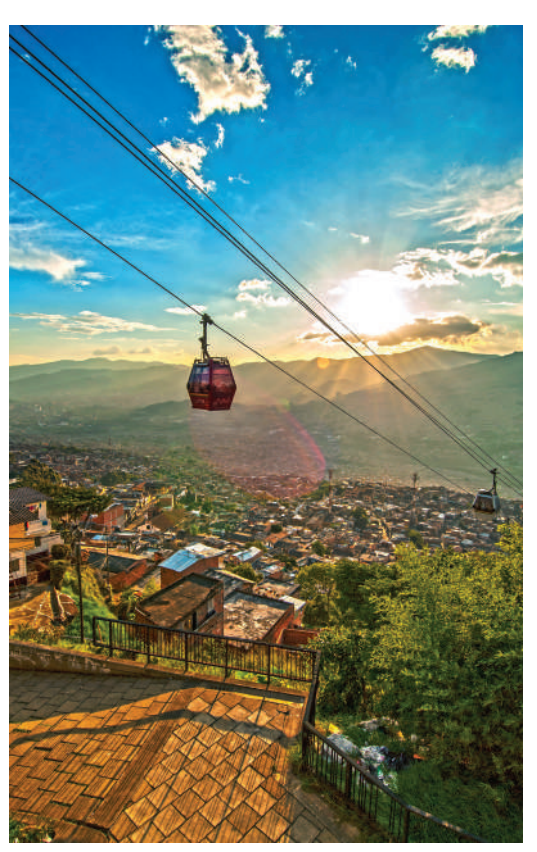
We ride the Medellin Metrocable over the city.