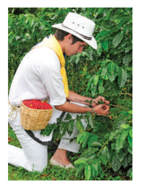
We visit a coffee plantation on Day 4.

Day 10: Cartagena Today we explore Cartagena's emotional heart: the walled colonial city ( Ciudad Amurallada ), a UNESCO World Heritage site that has