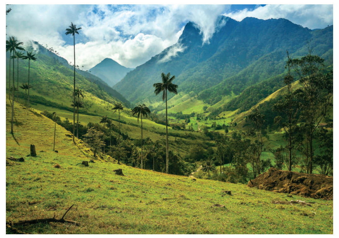
We explore the beautiful Cocora Valley on Day 5.

snow-topped mountains. Upon arrival we visit a coffee plantation for a tour and to learn about Colombia's role as a top producer of some of the finest java on Earth. We savor a coffee tasting, learning first-hand how to analyze the aroma, flavor, and body of good coffee. Then we continue on to our intimate bacienda , where we dine tonight. B , L , D