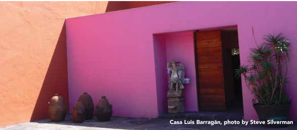
Casa Luis Barragán