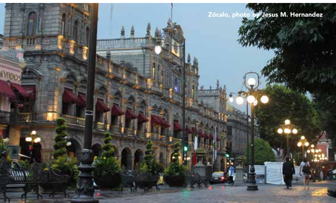
Zócalo

Explore the famed Casa Luis Barragán, home and studio of the Pritzker Prize-winning architect, on a private, before-hours visit (pending confirmation). Drive to the main campus of UNAM (National Autonomous University of Mexico), for a walking tour of this UNESCO World Heritage Site, which combines 20th-century modernism with pre-Hispanic references. The Museum of Contemporary Art (MUAC), a 2008 addition to the campus, is a special highlight. After lunch at the landmark San Angel Inn, visit the Diego and Frida Studios across the street, designed as a home and work space for Diego Rivera and his wife, Frida Kahlo, by architect Juan O'Gorman. An after-hours visit with cocktails has been arranged at the Palace of Fine Arts, to take in its stunning neoclassical exterior and Art Deco interior. Dinner is at a nearby restaurant. B,L,R,D