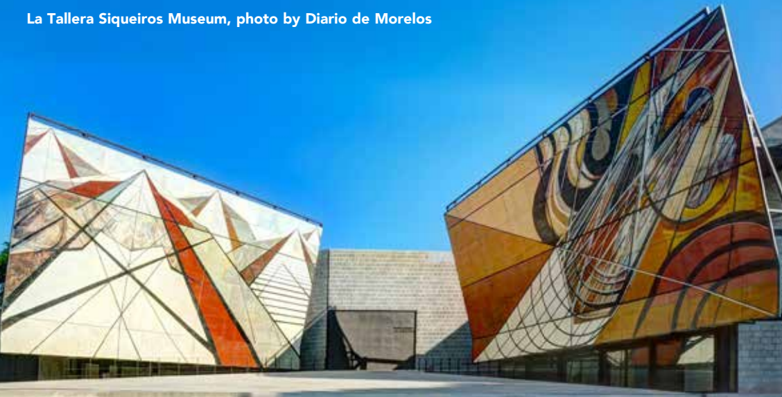
La Tallera Siqueiros Museum

DISCLAIMER: This itinerary is subject to change at the discretion of the Virginia Museum of Fine Arts and Arrangements Abroad. For complete details, please carefully read the terms and conditions at www.arrangementsabroad.com/terms .