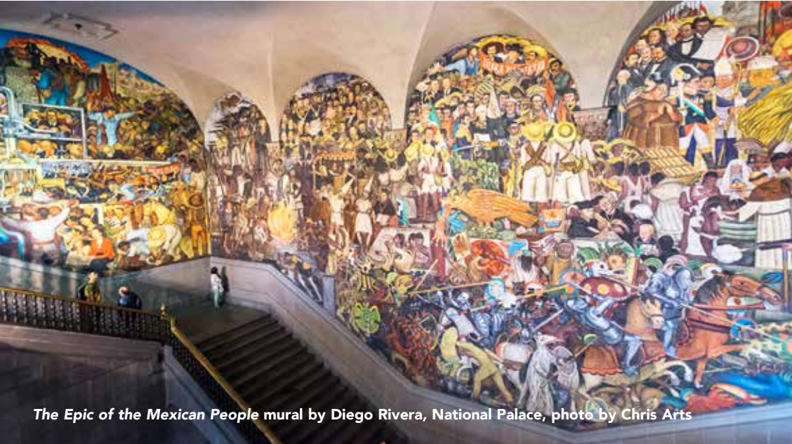
The Epic of the Mexican People mural by Diego Rivera, National Palace

PROGRAM RATE per person / double occupancy $5,495 SINGLE SUPPLEMENT $550