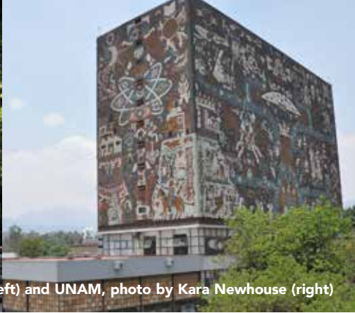
Museum of Anthropology, (left) and UNAM, (right)