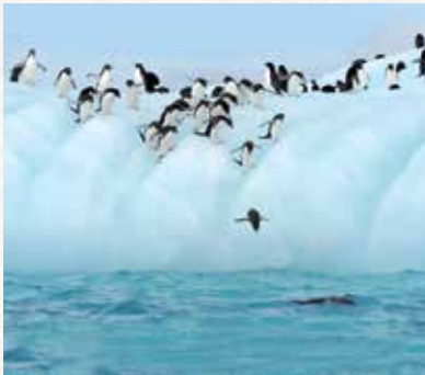
Penguins in Antarctica.