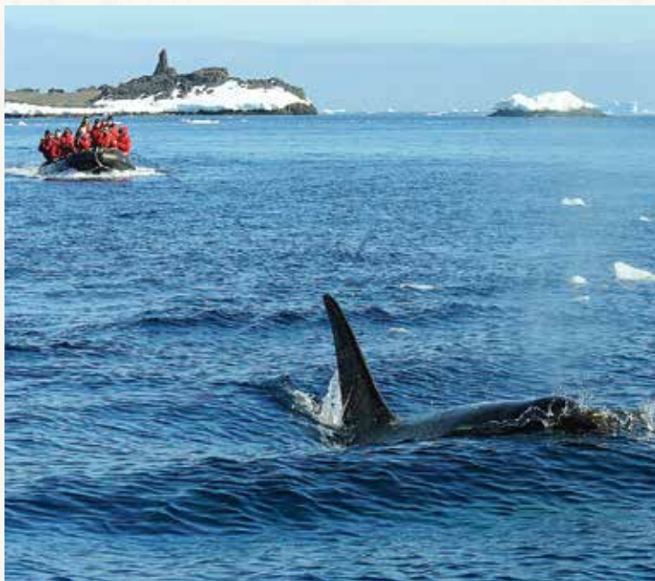
Naturalist-led Zodiac excursions offer spectacular opportunities to observe orcas and other whales surfacing in the Antarctic waters.